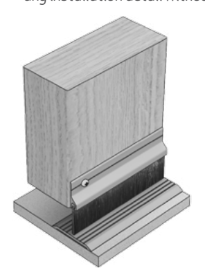
Door Bottom Installation Detail

Recommendations as to methods for use of materials and construction details are based on the experience and knowledge of Kilargo and are given in good faith as a general guide and service to designers, contractors and manufacturers. Kilargo reserves the right to make alterations or delete any installation detail without prior notice.