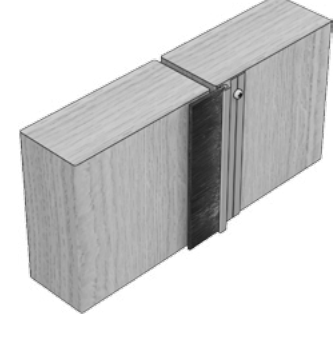
Meeting Stile Installation Detail