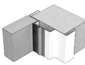
Perimeter Installation Detail