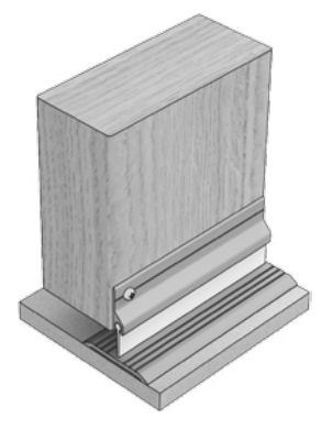
Door Bottom Installation Detail

Recommendations as to methods for use of materials and construction details are based on the experience and knowledge of Kilargo and are given in good faith as a general guide and service to designers, contractors and manufacturers. Kilargo reserves the right to make alterations or delete any installation detail without prior notice.