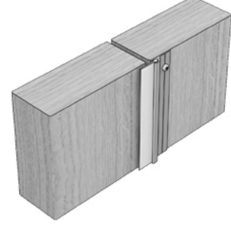
Meeting Stile Installation Detail