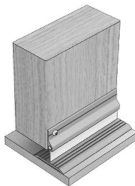
Door Bottom Installation Detail

Recommendations as to methods for use of materials and construction details are based on the experience and knowledge of Kilargo and are given in good faith as a general guide and service to designers, contractors and manufacturers. Kilargo reserves the right to make alterations or delete any installation detail without prior notice.