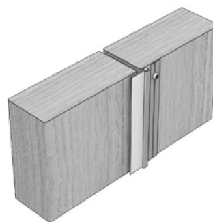
Meeting Stile Installation Detail